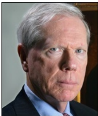
Paul Craig Roberts Has Questioned the Government's Jobs Numbers for Years

“Yet another figure of importance that doesn't get much press: those working part time but wanting full-time work. If you have a degree in chemistry or math and are working 10 hours part time because it is all you can find — in other words, you are severely underemployed — the government doesn't count you in the 5.6%. Few Americans know this.” (Read the full article here .)