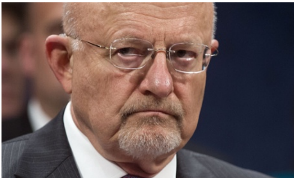
James Clapper decried the release of the information and said media reports about it have been inaccurate

Glenn Greenwald theguardian.com, Friday 27 September 2013 07.14 EDT