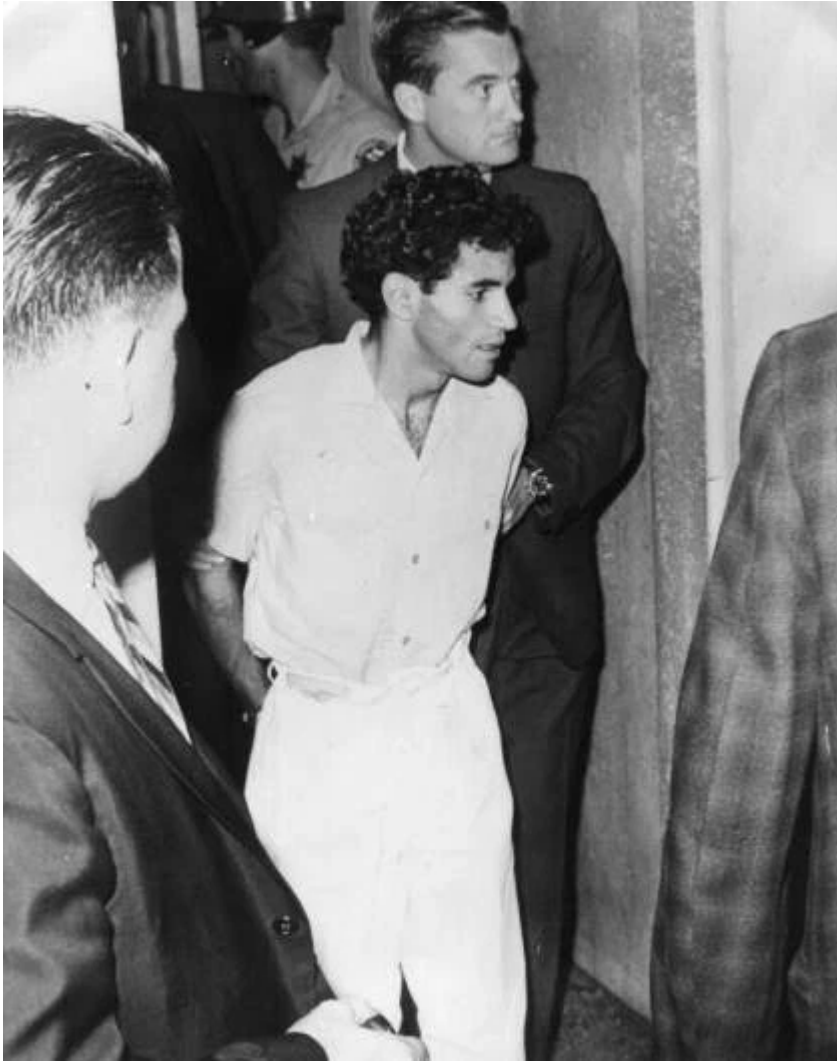
Sirhan Sirhan, charged with the assassination of Senator Robert Kennedy during a campaign stop in California.