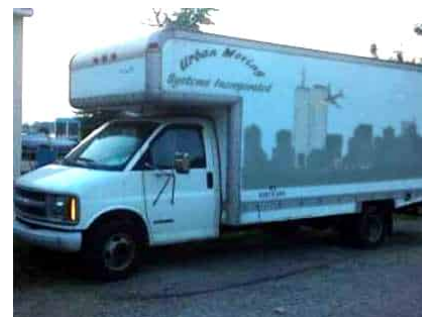
Bernard Kerik helped Israeli 9/11 terrorists escape

One possibility is that our mobbed-up trio is on the Bibi side of the Bibi-vs.-Ehud Barak war for the future leadership of Israel. After all, Rudy and Bernie helped Bibi blow up the Twin Towers and get away with it; one assumes they are on Bibi's team. So Epstein may have been eliminated, or expatriated, by the Ehud Barak side. (Bibi is using Barak's closeness to Epstein as a club to repeatedly whack Barak over the head with; it might be in Barak's interest to have Epstein disappear, and in Bibi's interest to expose the disappearance.)