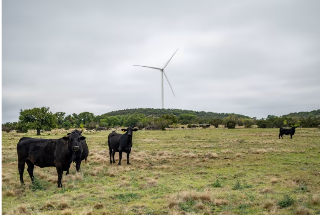
Cows stand in a field on the ranch near Eldorado, Texas.