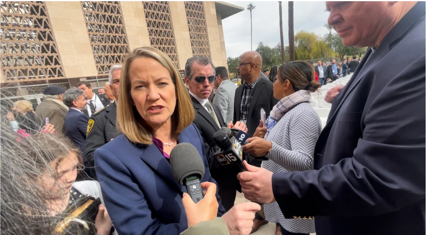
Arizona's New Attorney General Democrat Kris Mayes

The newly selected regime heading up Arizona's top statewide offices is now targeting Kari Lake with potential felony charges for speaking out against the rigged election in Arizona.