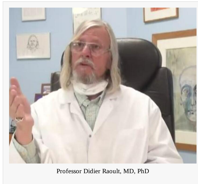
Professor Didier Raoult, MD, PhD

"YouTube will ban any content containing medical advice that contradicts World Health Organisation (WHO) coronavirus recommendations. Anything that would go against World Health Organisation recommendations would be a violation of our policy."