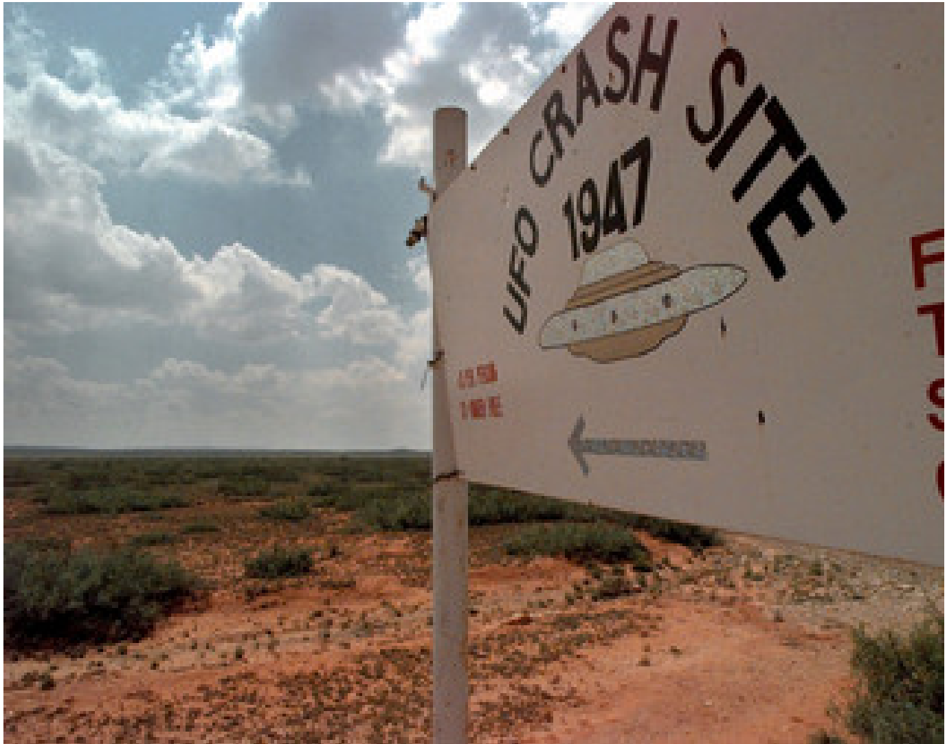
A sign directs travelers to the start of the "1947 UFO Crash Site Tours" in Roswell, N.M., on June 10, 1997.

The benefits to humanity outweigh the fear of discovering we're not alone in the universe.