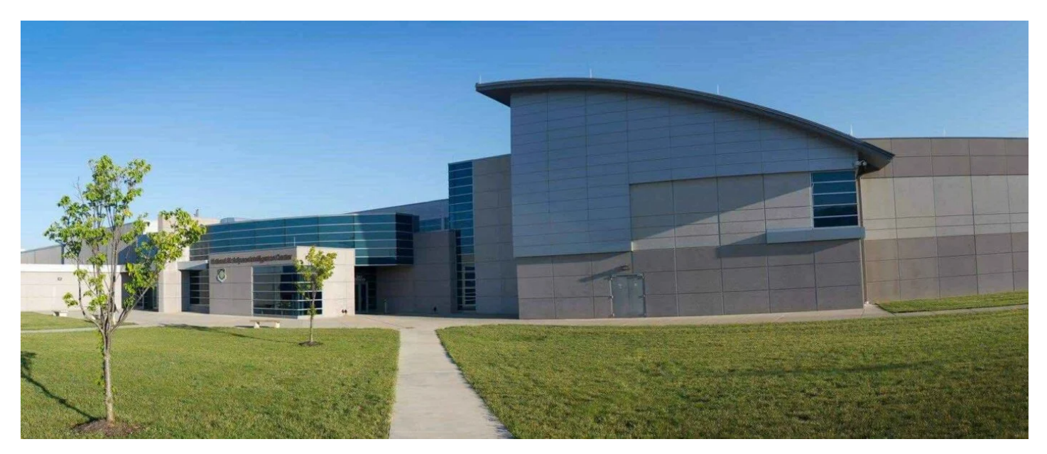
National Air and Space Intelligence Center headquarters at Wright Patterson Air Force Base (Image Credit: NASIC/Facebook).

It is unusual for an Air Force insider to come forward, as the Air Force <u>has been less forthcoming</u> than other agencies with regard to UAP. (https://thedebrief.org/why-