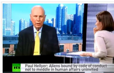
Canadian Defense Minister Discusses Aliens in the US

The origin of this juicy conspiracy theory is the site WhatDoesItMean.com ; The Iranian news outfit FARS merely rewired the story. They then provided compelling context around it, including Paul Hellyer's TV appearance for Russia Today a few weeks before the story broke. This context is something the Western media refuses to share with their readers.