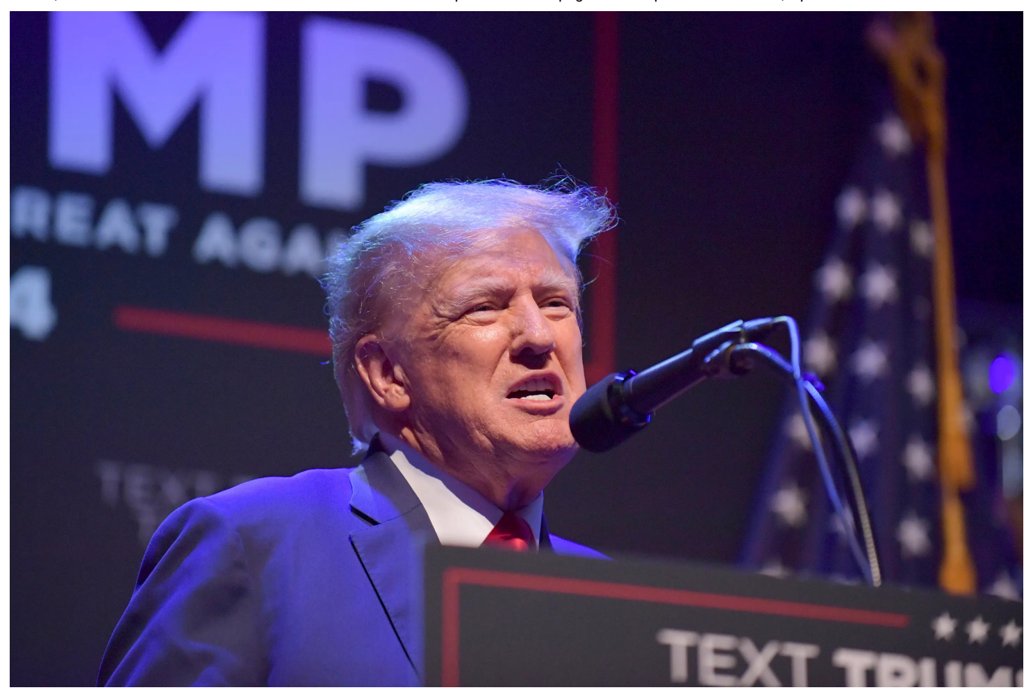
The complaint, from lawyers for former President Donald Trump, asks the FEC to record the infamous letter as an "in-kind contribution" because it allegedly was used to influence the outcome of the election.