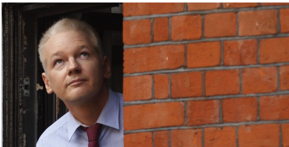
Julian Assange at the window of the Ecuadorean Embassy in central London in 2012.

Updated: July 30, 2013 | 1:40 p.m. July 29, 2013 | 5:01 p.m.