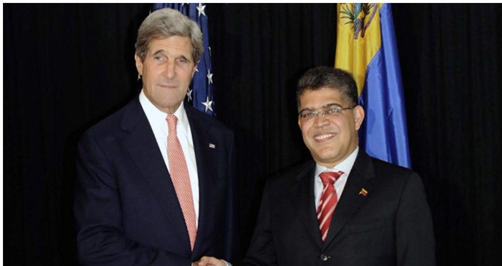
US Secretary of State John Kerry (L) shakes hands with Venezuelan Foreign Minister Elias Jaua before a private meeting in Antigua Guatemala, 50 km southwest of Guatemala City on June 5, 2013.

"Immunity is for the president, not the plane," the ABC source cites Kerry's personal message to President Maduro as saying.