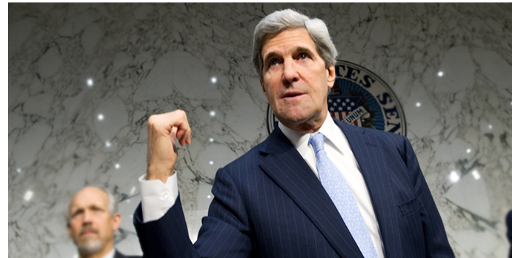
US Secretary of State John Kerry

Published time: July 19, 2013 14:00 Edited time: July 20, 2013 16:28 Get short URL