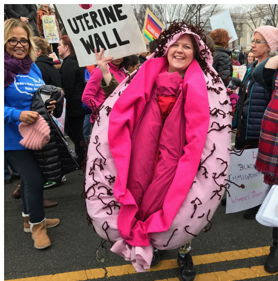
What began with the Crusaders will end with this...