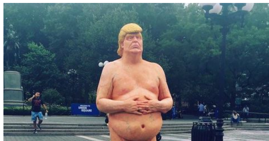
The last emperor is also naked...

On January 18th of last year I wrote an article entitled “ The good news about the Trump Presidency: stupid can be good! ” in which I tried to show that by his illiterate actions, Donald Trump was maybe not making “America” (should be the “US” but never mind that megalomania) great, but he sure was weakening the AngloZionist Empire. But this is much bigger than just one narcissistic person, What we are witnessing today is the agony of a civilization which has outlived itself and now that the Empire is in its dying throes I want to mention another good thing Trump did: he became the emperor who himself shouts “ the king isn’t wearing anything at all! ” (in the original story , a child does that, but in this case, we have a “fused” “child-emperor” who does that himself).