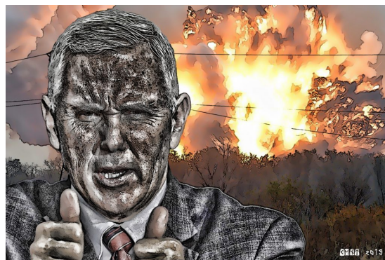
No more ‘human face’ for capitalism!

When the Neocons finally came out and showed their true face, they did more than just affect the image of the US abroad, they also gave a signal to their colonial administrators that all pretense of decency could now be dropped. Force, brute force, was now the order of the day. This is why Theresa May could spew out the most ridiculous and self-evidently stupid lies about the Skripals (or about Syria, for that matter) or Macron could ban RT from the Élysée and nobody would peep. This is also why Poroshenko can safely declare that the Russian armed forces have invaded the Donbass or the EU can declare that the Russians are culprits in the recent Kerch bridge incident.