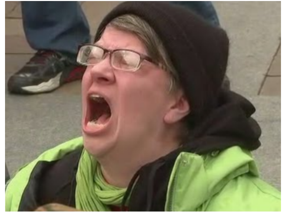
Trump Derangement Syndrome

The reason why the Neocons and their Deep State love to support all types of minorities is very plain and simple: minorities and their (hyper narrow) political agenda represent absolutely no threat whatsoever to the real, hidden, powers which run the Empire. Furthermore, minorities are extremely easy to manipulate. Thus these various minorities represent the ideal power base for a party like the Democratic Party which can then use its control over minority (identity) politics in its struggle against the Republican Party.