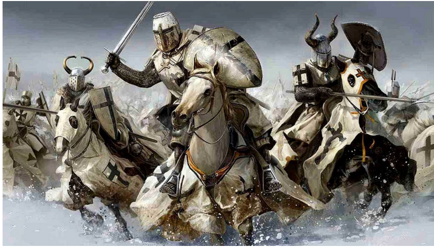
The true birth of the Western Civilization

This civilization can be characterized by tremendous intellectual, technological and scientific achievement, arguably the most beautiful music ever composed (especially J.S. Bach) and many other artistic and architectural masterworks. Alas, it also has a darker side: imperialism, racism, genocide, slavery, religious and political persecutions and, of course, two world wars. So that record is checkered, to put it mildly, but it cannot be denied that in spite of its sins and flaws, western civilization also brought the world an immense intellectual legacy which inspired people worldwide. If you ask most western people what they associate with the western civilization they would probably name things like the scientific method, democracy, human rights, civil rights, the separation of powers, equality before the law, etc. People from other civilizations might view the western civilization in a very different way, but we can ignore that for our purposes. But what the so-called “collective West” (aka the AngloZionist Empire) is showing today is the exact opposite of what the West is supposed to stand for. Here are just a few examples: