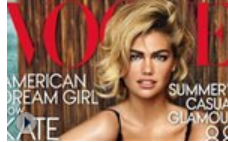
Kate Upton and the Rise of the Curvy Customer