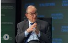
Greenspan: End of Cold War Caused 2008 Crash