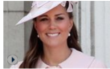
New Details on Birth of Britain's Royal Baby