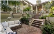
Jodie Foster Lists West Hollywood Home for $6.4M