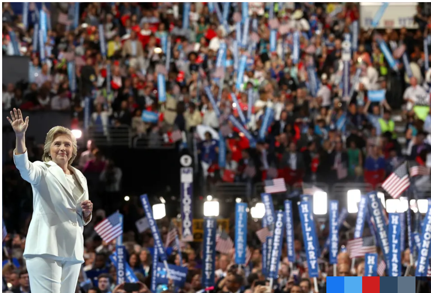
Democratic presidential candidate Hillary Clinton acknowledges the crowd at the end on the fourth day of the Democratic National Convention at the Wells Fargo Center, July 28, 2016 in Philadelphia, Pennsylvania.

It's unclear, in general, how much of a place women had in the unmarried Tesla's life. By all accounts he was somewhat of an asexual being, focused solely on the mind work.