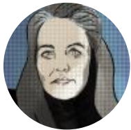
Caitlin Johnstone @caitoz

So mainstream culture presents a fraudulent image of reality. It's written into the code of everything that's mass produced — not just in Prager University lectures on the evils of socialism or propagandistic news stories about weapons of mass destruction, but in sitcoms, in advertisements, in clothing brands, in pop music, in textbooks, in trends. When it's not constant messaging that capitalism is totally working and the world is ordered in a more or less sane and truth-based way, it's manipulations designed to shape our values and measures of self-worth to make us into better gear-turners. If you're noticing this ubiquitous fraudulence, it's not because you're becoming distant from the rest of society, it's because you're becoming more intimate with it. You're getting in real close, so close you can see the nuts and bolts of it, see how the sausage is made.