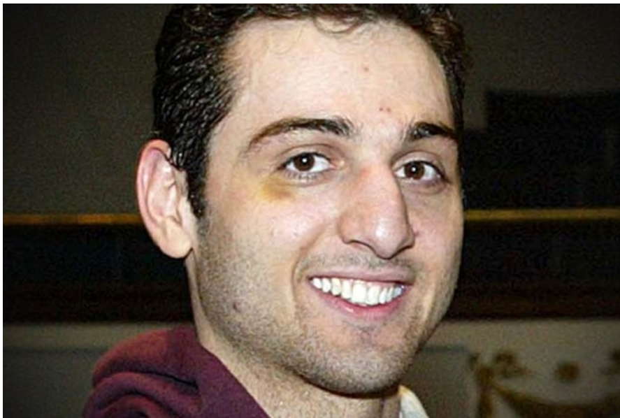
Tamerlan Tsarnaev

TOPICS: CONSPIRACY THEORIES, TAMERLAN TSARNAEV, DZHOKHAR TSARNAEV, BOSTON MARATHON, BOSTON MARATHON BOMBING, ALEX JONES, POLITICS NEWS