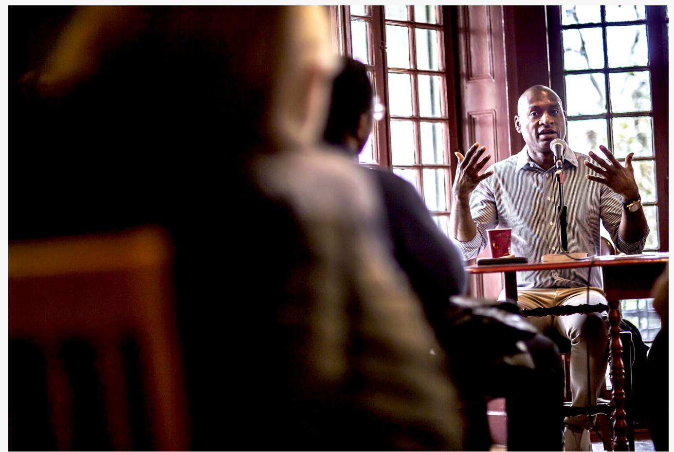
Charles Blow in April 2018.

This is a truly curious pirouette. The New York Times is perfectly pleased to swindle its readers into thinking and believing anything as just noted — the justice of a proxy war, China as the aggressor in the Pacific, America has a terrific health care system, and so on but if its readers think and believe something the Times does not want them to think and believe, it's time to stop encouraging them to think for themselves.