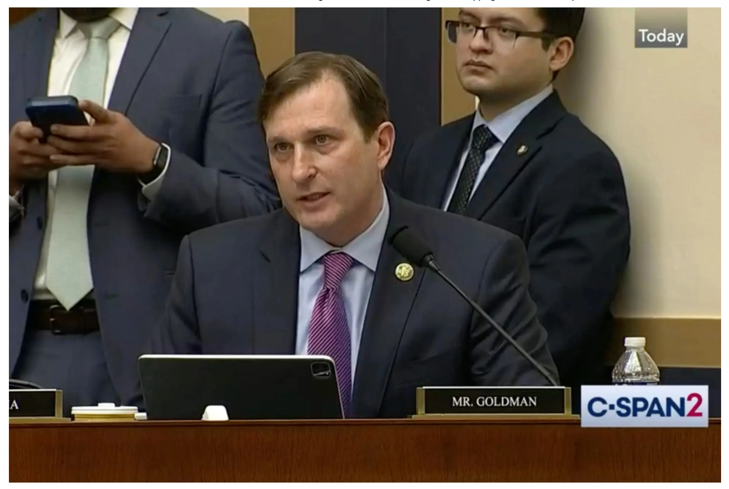
Rep. Dan Goldman claimed at the hearing there is no evidence the FBI pressured Twitter to censor "lawful" speech.

The New York Times and the Washington Post have not written one word about this hearing at which Democrat members of Congress tried to intimidate a journalist into revealing his sources.