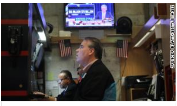
The Fed is cutting rates. Here's how to invest

Yet those factors were well known ahead of time, suggesting markets and the Fed should have been prepared.