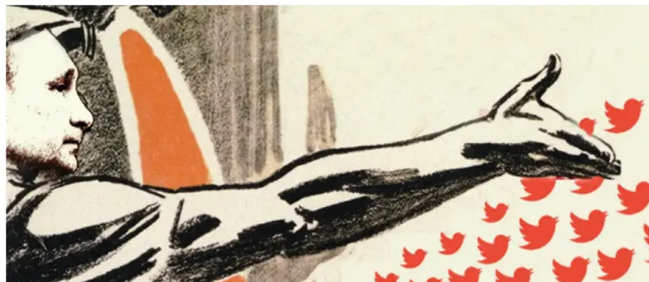
Alliance for Securing Democracy