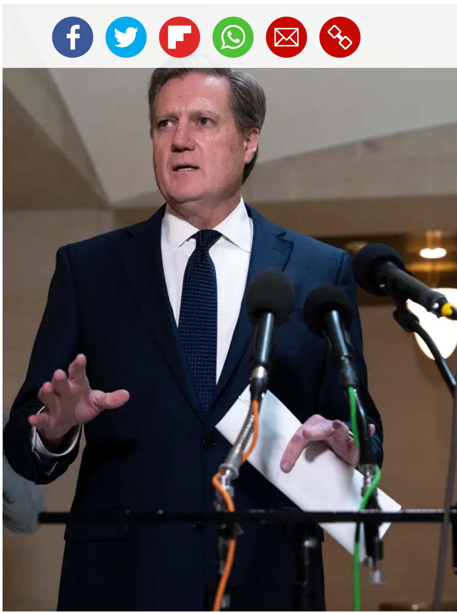
Permanent Select Committee on Intelligence Chairman Mike Turner (R-Ohio) in the letter said the analysts were “experienced officers with significant scientific expertise.”