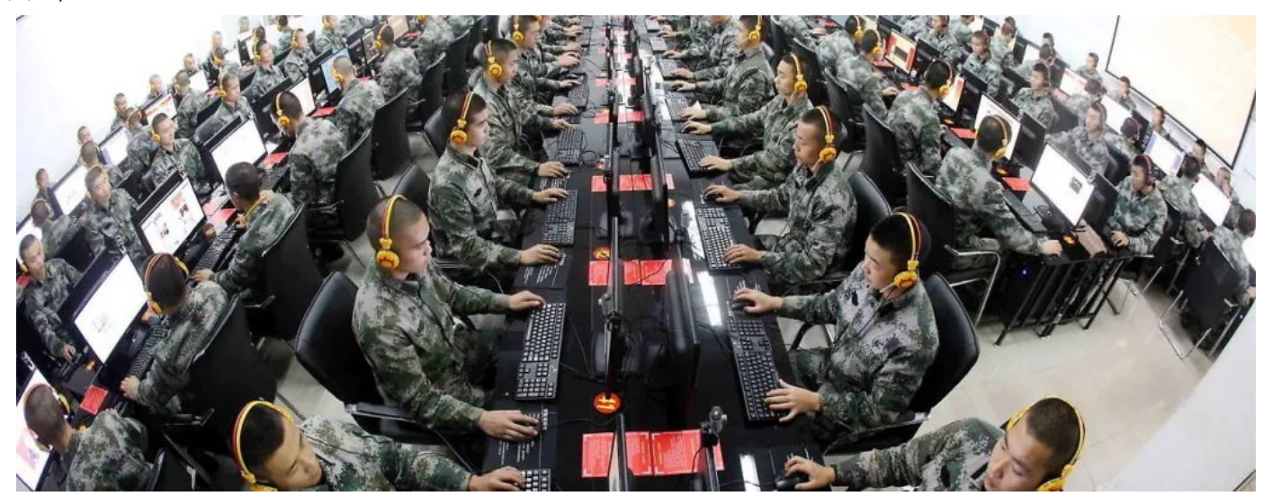
Stop me if you've heard this before, but this is an infowar and the powers-that-shouldn't-be are engaged in "a war for your mind."

Of course, you have heard of "Infowars" if you've been in the alternative media space for any length of time. And for good reason: information warfare is an absolutely essential part of the war on everyone that defines fifth-generation warfare.